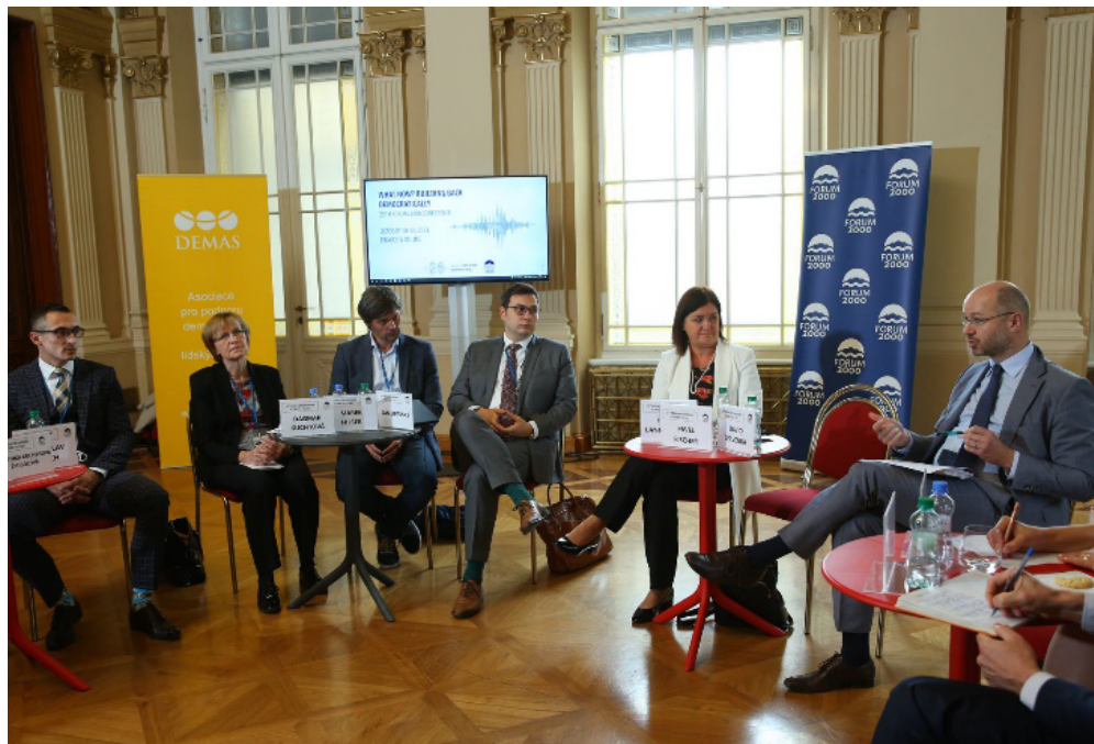
Debate at the Forum 2000 conference.

foreign students at the Department of Development and Environmental Studies of the Faculty of Science of Palacký University in Olomouc for the fourth time. Lectures by experts from the field complemented theory and gave students an insight into specific, practical problems. The cooperation of municipalities and citizens on the preparation of participatory budgets (Agora CE), the issue of contemporary political and social transformation in Ukraine (People in Need), the issue of political corruption in relation to good governance (Transparency Int.), the issue of authoritarian regimes (CEEI Inst.) and transition cooperation in practice (DEMAS) were presented in five case studies. A half-day workshop on the increasingly important topic of manipulation with information (AMO) and the professionalization of NGO work (DEMAS) was organized as part of the English course for inter-